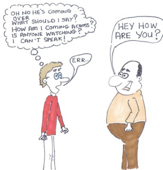
Shyness makes us overthink

The ten steps of this overcoming social anxiety course will help change all three of these facets of shyness.