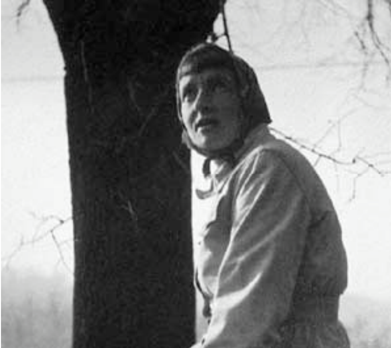
Mildred Norman Ryder (later Peace Pilgrim) in her hiking days.

First woman to hike the entire AT in one season.